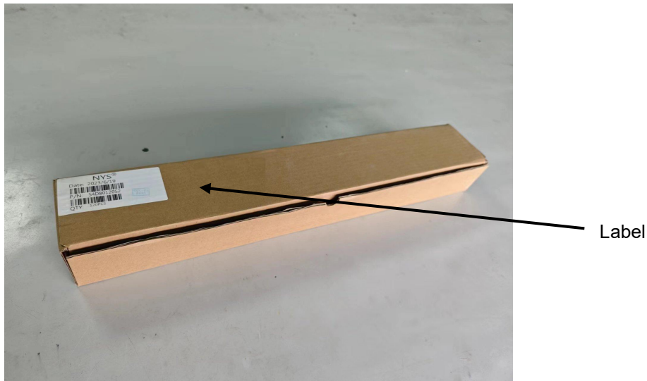
Fig.1- Tube pack for SOT-227